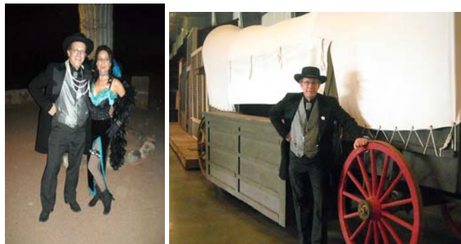
"THE RIVERBOAT GAMBLER"